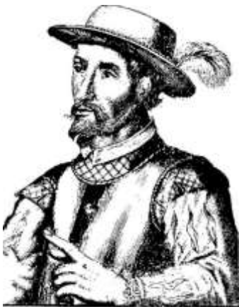
On Easter Sunday in 1512, Ponce de Leon saw Florida

It was a myth that led to the discovery of Florida. In the folklore of Europe, there was a story of a magic spring that existed somewhere in the world. It was called the "Fountain of Youth." According to the legend, anyone who would drink from that spring would be cured of any sickness and would regain his youth.